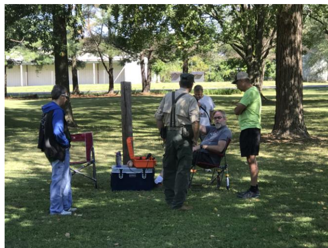
Group discussing POTA