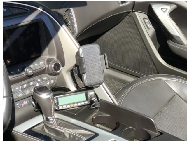
Dean's K9JDW sharp looking mobile installation.